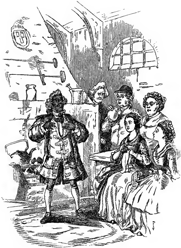
Gumbo astonishes the Servants' Hall.